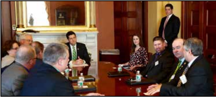
A highlight of the WCGA trip to Washington, DC, was meeting with Wisconsin Rep. Paul Ryan, now the Speaker of the U.S. House of Representatives.